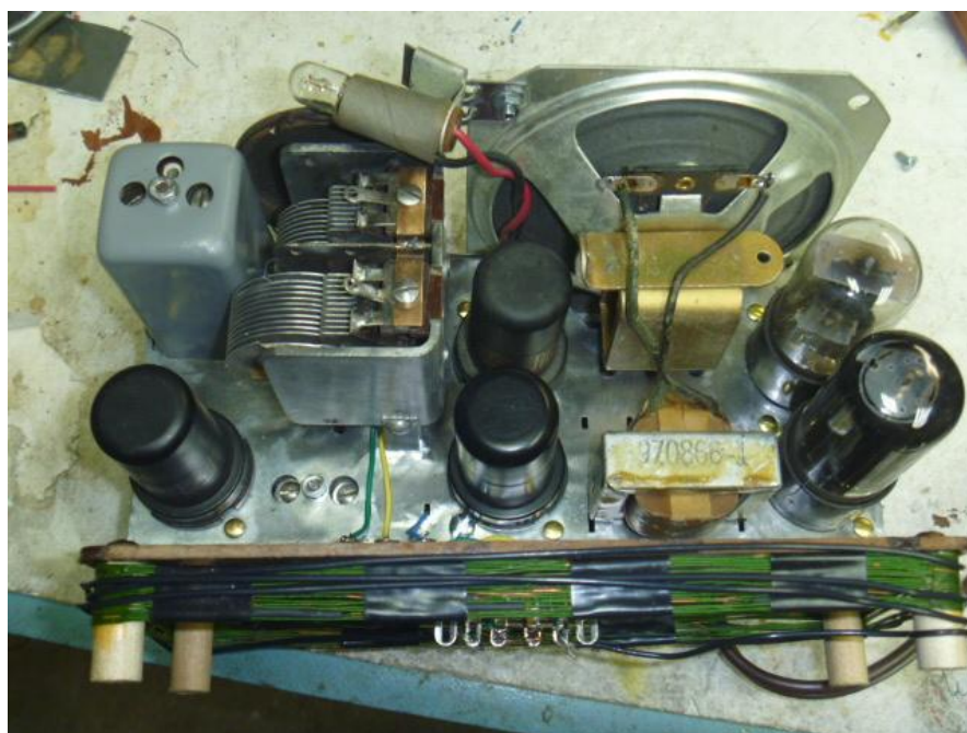
Finished chassis top view

If anyone has any questions, please feel free to drop me an email at k4elv@bellsouth.net .