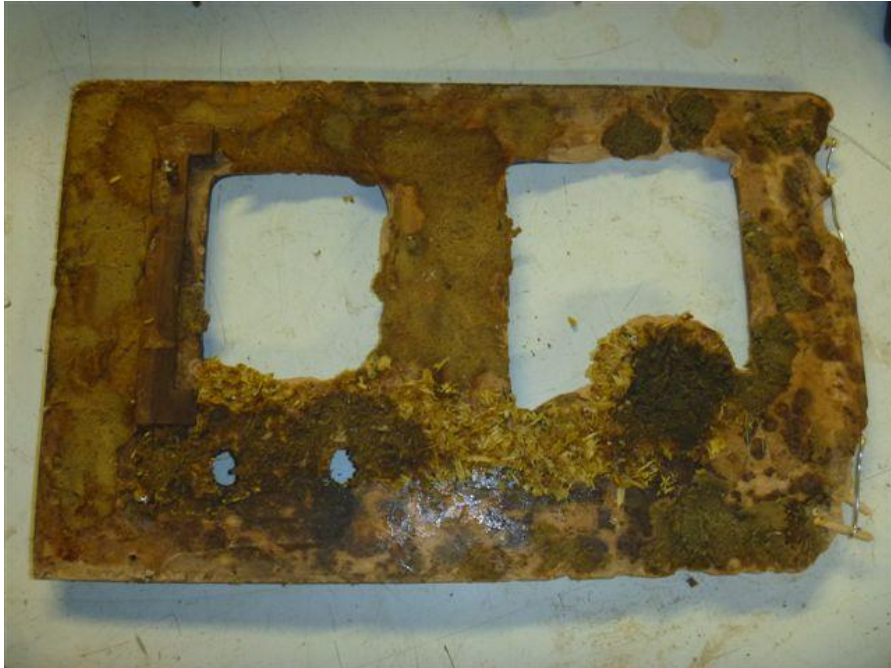
Back side view of case front. The dark brown areas are hide glue/sawdust mix used to fill deep holes.

leaving huge holes. The remainder of the case was litterly falling apart! It looked rather hopeless. Nonetheless, I told Dave I'd give it a try.