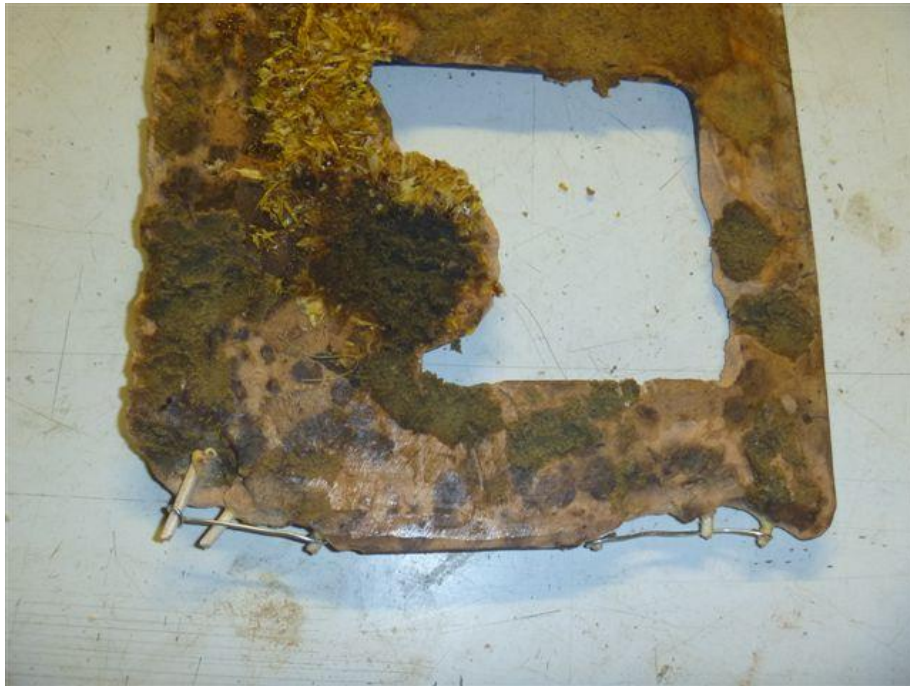
Tooth picks glued into holes drilled into case face. Wire strung between the tooth pics to form a base for layering the Bondo.

The main case required major repair. The plywood base layers were pulling apart. I separated each layer and re-glued them. The top of the base was so badly damaged; I laid a new layer of veneer on to it. The sides, top and handle were severely nicked. After gluing all of the parts of the case together and sanding thoroughly up to 400 grit sandpaper, I finished with Bartley's gel stain. The nicks were then repaired with several coats of sanding lacquer applied with a small brush and/or tooth pick into each nick. The final finish included several coats of spray lacquer sanding between coats using 600 grit sandpaper and XXXX steel wool.