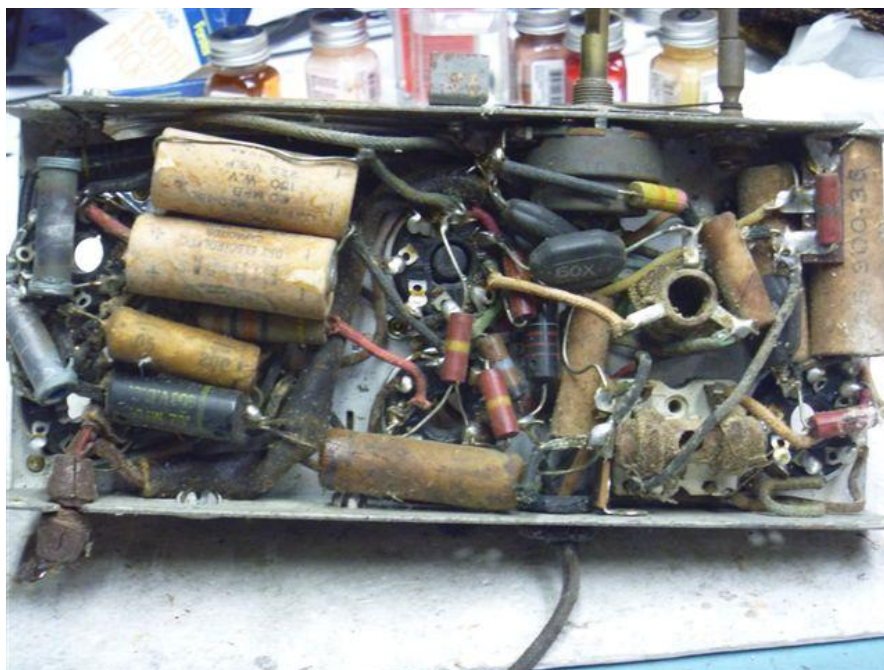
Under chassis view

The last problem was reconstructing the internal antenna, which was completely missing. An on-line search gave me an idea of how the original unit was made and mounted to the chassis. The schematic indicated that the resistance was 1.5 ohms. Since there is no RF amplifier stage, the antenna was designed to be part of the tuned input circuit. Various wire was tried, but the only wire that worked was Litz wire. I also found that without an RF amplifier stage, an outside antenna was needed. In order to couple the outside antenna to the internal antenna, I added 100 pf capacitance to achieve a maximum match.