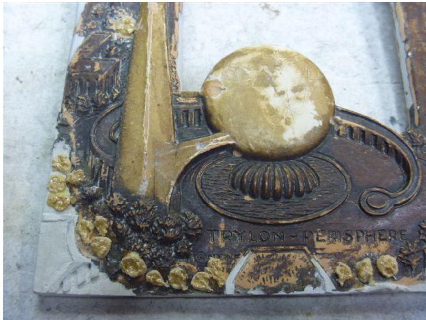
Carving features in Bondo and placing tree features.