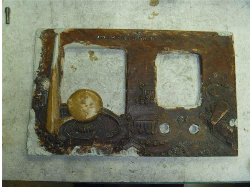
Bondo layered on corners and side fill.