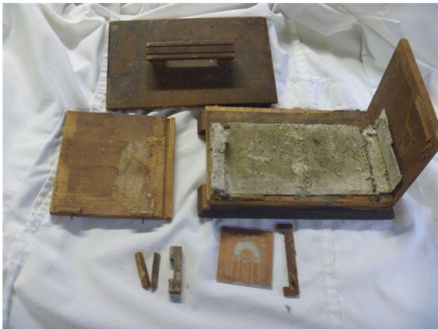
Remainder of case. The white material is asbestos for heat.

I did an internet search and found numerous pictures of the original radio and a surprising amount of history. One source reported that thousands of the little radios were given away at the RCA pavilion. I suspect that may be one reason why the radio