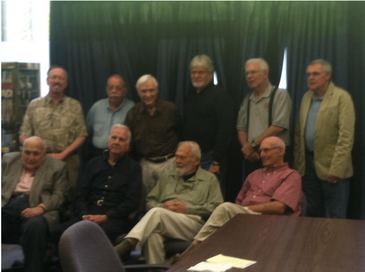
Some of the “Legends” present at the 2013 “Legends of Broadcasting” Event

Each spring, we have a Swap Meet at the Shop and open up the Shop for tours and the parking lot for vendors to sell their radio gear, new and old, and to have fellowship with folks with like interests. As our storage rooms fill with donated equipment and magazines, we are going to need several Swap Meets annually to clear out our excess stuff. There are dozens of pictures of our last two Swap Meets at the Shop on our website, ALHRS.org.