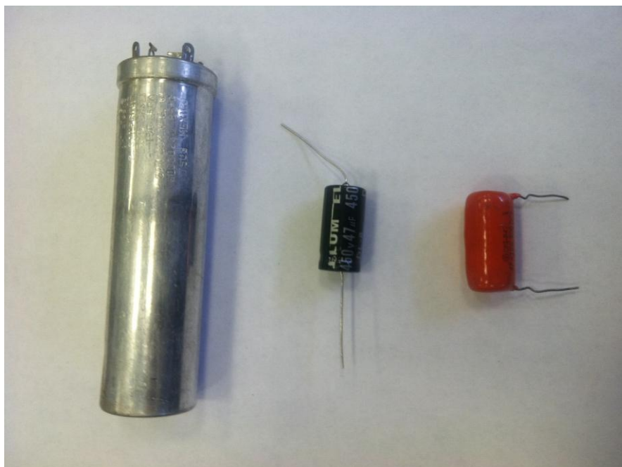
Can multi-section electrolytic capacitor, Axial electrolytic capacitor and Orange drop capacitor

Let's make a check to see if the filter capacitors are good or bad. Take a volt and ohm meter (digital or analogue meter), put the meter in the ohm position - place the common lead on the chassis in most cases, or place the common lead on the ground lead of the capacitor, then the positive lead on the cathode of rectifier. You should read one meg ohms or more. If you read a low ohms, then replace the filter capacitors.