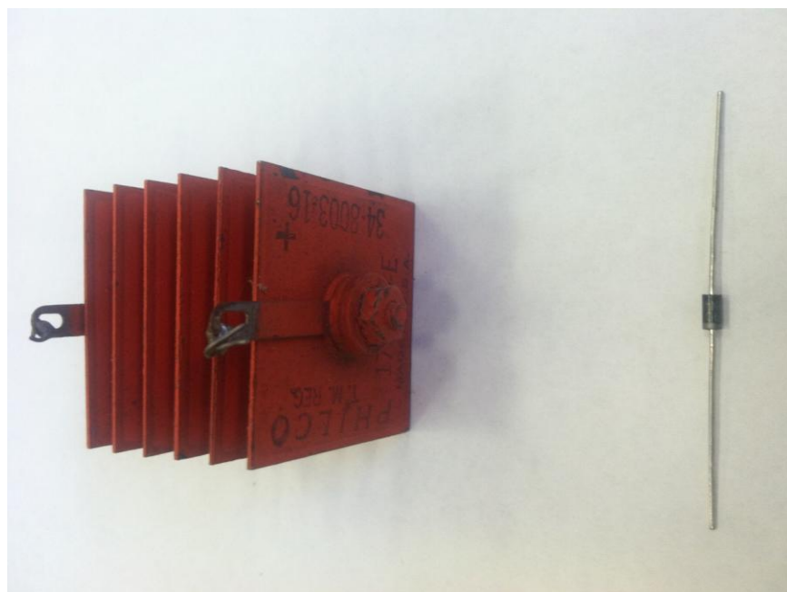
Selenium rectifier and Silicon diode rectifier (1N4001)