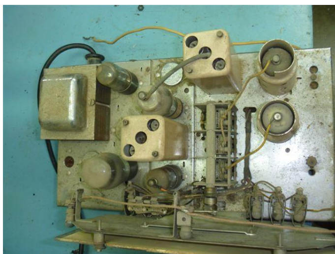
Original RAP radio chassis