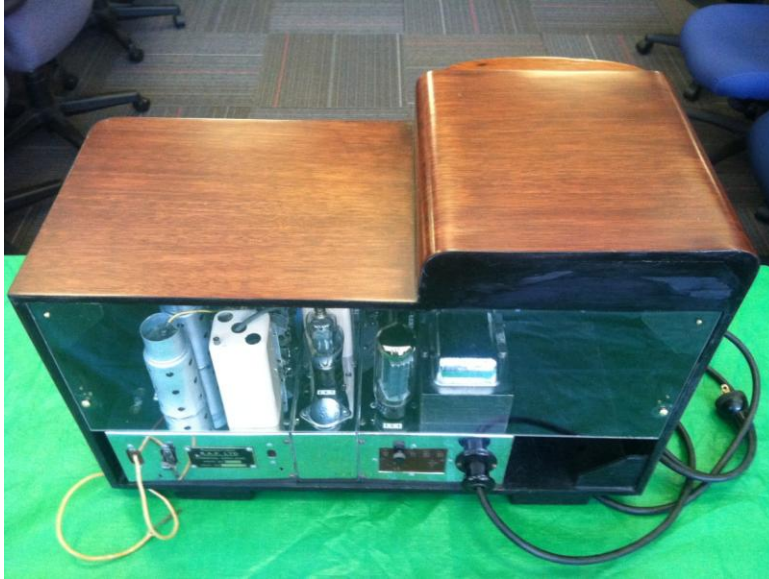
Rear View of R.A.P. Radio after Restoration