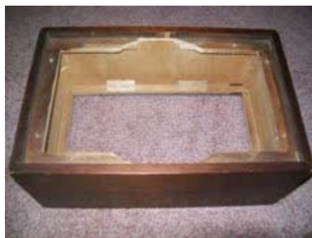
This is the Box for the meters.