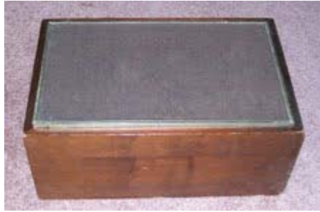
This is a speaker that I purchased a local thrift store for $1.00.

I have wanted to build a voltage and current monitor for the work bench to use when I work on the vintage tube radios. I purchased a 150 Volt voltmeter, a 500 mille-amp ammeter, and 1 amp ammeter for $5.00 each at the Huntsville, AL HamFest (2010). All are A.C. type meters.