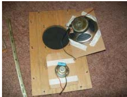
The grille and speakers are removed.