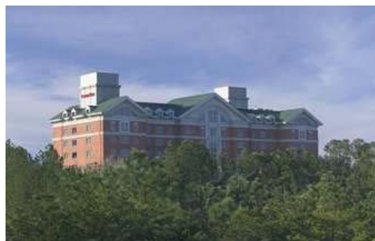
Hotel at top of the hill (across street from Red Lobster)