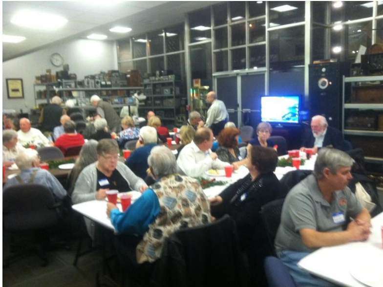
2013 Christmas Party

folks have signed up so far. We had around 65 attendees last year. You can send me an email if you plan to attend, but have not signed the sheet at the Shop. Name, number of attendees, and food item you are bringing, are the things I need to know for the party. We are limiting this party to adults. Thanks!