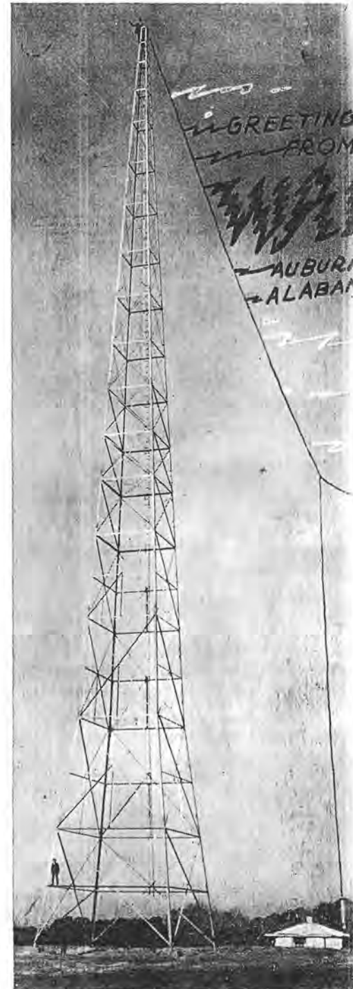
Wavelength 325.9 Meters

We broadcast on a wavelength of 325.9 meters, or a frequency of 920 kilocycles, by authority of the Federal Radio Commission.